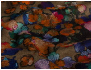
054 taupe grau