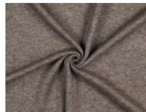
005 taupe melange