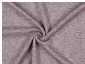
023 violett melange