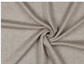
002 beige melange