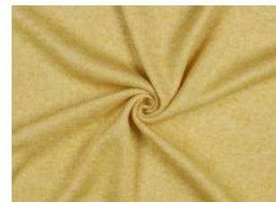
008 lemon melange