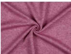
015 kirsche melange