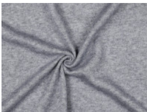
022 marine melange