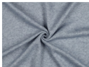
017 babyblau mel.